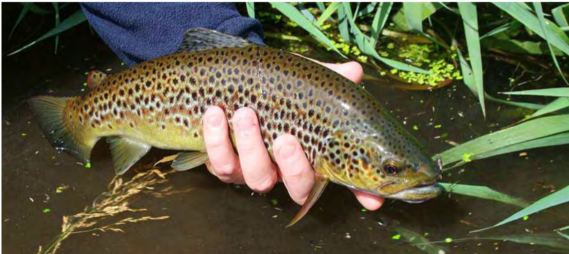
Another superb wild brown trout goes back into the water unharmed.

Let's hope that we will be able to start the 2021 season on 1 April.