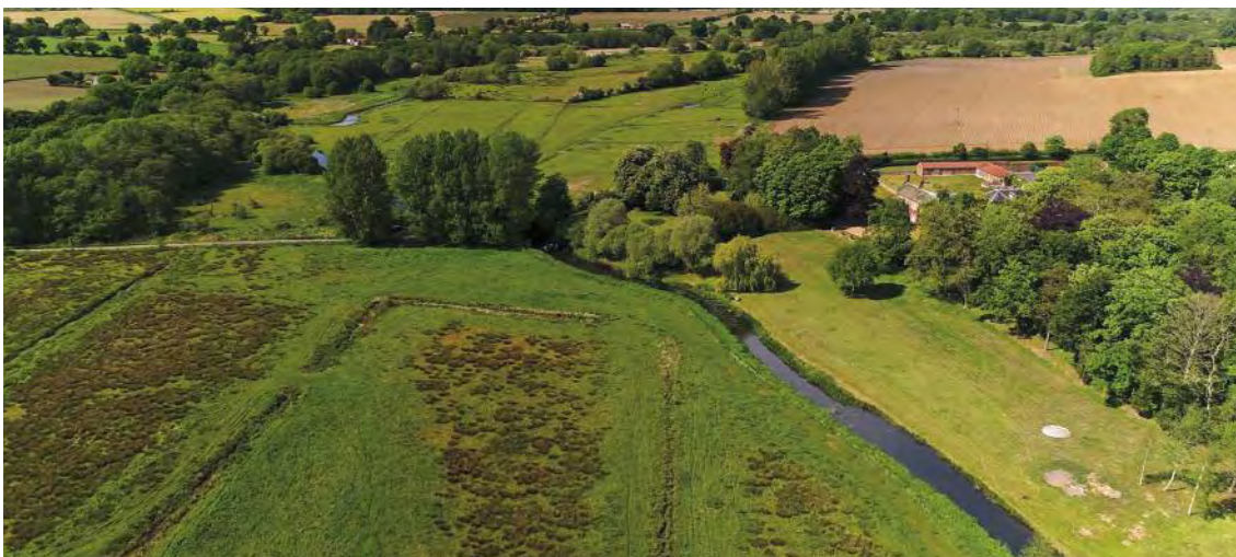
A still from the video on the website showing the day ticket beats

The website has been instrumental in helping us to sell a large number of day tickets and to generate the best waiting list that we have ever had. In fact the number got so high that we closed it in early September. Asking those on it to accept our GDPR policy helped reduce the overall number somewhat, as those who did not respond to our request were removed from the list. The sale of day tickets was probably boosted by the fact that many rivers were closed to visitors for much of the season.