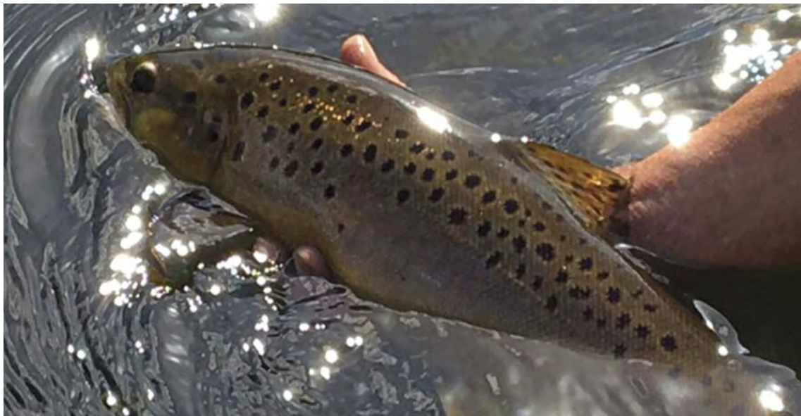
Large wild trout are being increasingly caught every season, indicating a thriving population. Our ongoing programme of habitat improvement is designed to ensure a long term future for our wild fish.

The most notable figure in this season's catch returns is the extraordinary number of wild fish that were caught: 330. Along with that high number is the biggest fish that was caught was measured at 24 inches and probably weighed at least 5.7lbs, according to length-to-weight tables, and possibly a bit more. A stunning wild Wensum trophy brown trout that was caught on the Yarrow Farm Beat. This was an inch longer than the best fish caught on the Bintry Mill Beat. The best wild fish caught by a day ticket visitor was 20.5 inches overall.