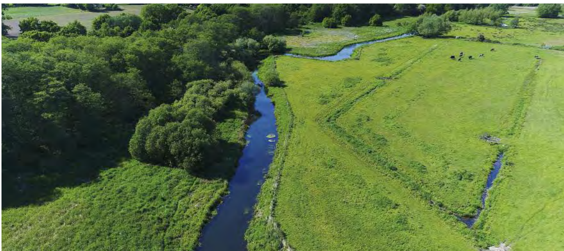
The true right hand bank immediately above Yarrow bridge has undergone extensive clearing work to improve access to the water and the left-hand bank downstream of the gas pipe crossing (at the top of this photo) is also due to be improved during the coming season.

Your Committee will be working hard over the winter to increase the length of fishable river bank that is not now readily accessible or perhaps only by the intrepid and fearless. The areas selected for improvement are a stretch of the Bintry Mill Beat above Blake’s Pool on the true right-hand bank and on the Yarrow Farm Beat the stretch downstream of the bend after the gas pipe crossing on the left-hand bank. We will be doing preparatory work in readiness for work on the banks when ground conditions and water levels allow safe access in the Spring and Summer.