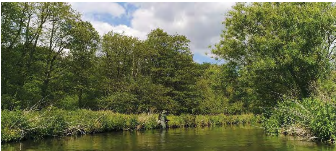
Habitat improvement is the key to increasing the wild trout population.