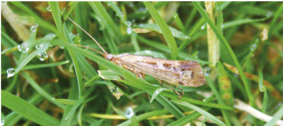
Abundant aquatic life, like this cinnamon sedge, is the key to a successful wild trout population.

Your committee has agreed to continue to put stock fish in the river next season. This will be to supplement the increasing stock of wild fish and not overwhelm them. The first stocking next season will take place on 10 May and future dates will be advised nearer the times. The colour of the tags will also be advised before the first stocking. We will continue to put the fish into the river in drops of no more than six at a time to discourage them from shoaling which can be a problem with triploid stock fish.