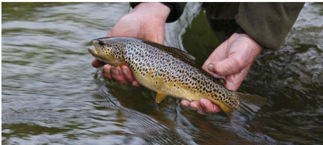
Wild brown trout like this are increasingly being caught.